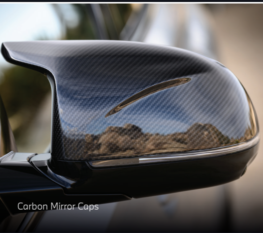
Carbon Mirror Caps