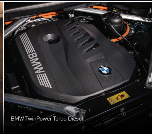
BMW TwinPower Turbo Diesel