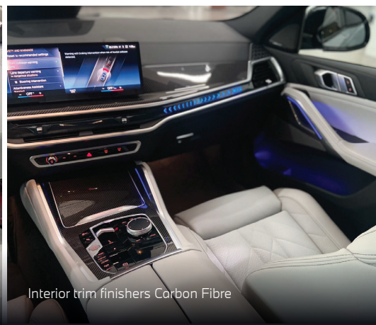
Interior trim finishes Carbon Fibre