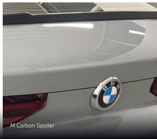
M Carbon Spoiler